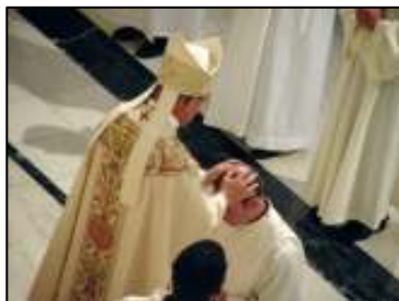
Laying on of hands

The celebration continues with a reception following the Mass of Ordination. The following day, or shortly thereafter, the new priest celebrates his first Mass giving thanks to God and to all of those who have helped him along the way. Family and friends usually gather for this special Mass.