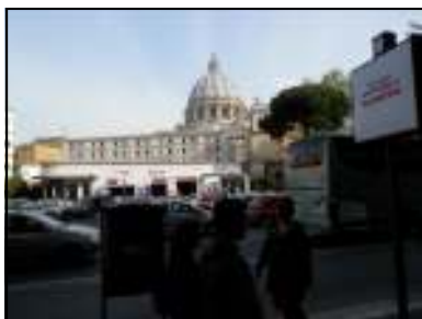
St Peters' cathedral, Vatican city, from the end of street, about 200m from our apartment.

I would like to tell you about some of our experiences in Rome - I visited the tomb of St Peter, underneath St Peter's cathedral. In Rome we also visited the four major Basilicas of Rome – St Peters, St John Lateran (the Popes' Church for the