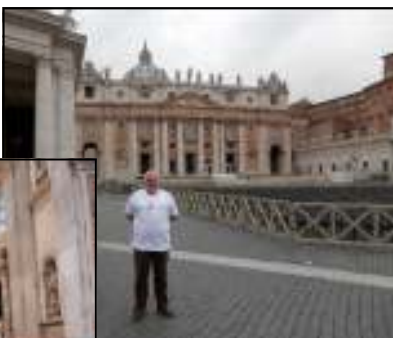
Above: My friend in St Peters square, Vatican City Left: Inside St Peters Cathedral looking to the High Altar.