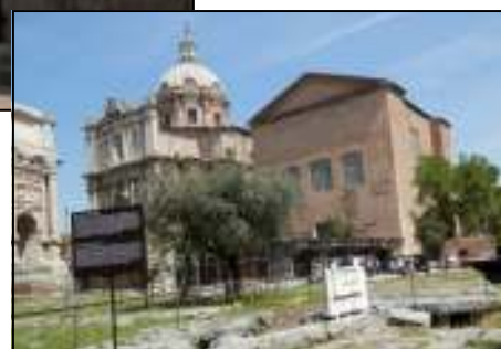
The Forum and (above) the Senate, at the Forum. The Roman Empire was governed from this building.

During the tour, our group was stopped by two plain clothes