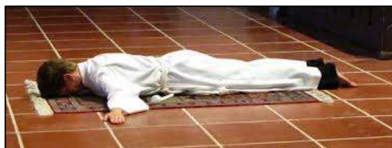
Prostration (lying down) before the altar